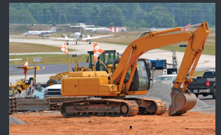
LOW IMPLEMENTATION & OPERATING COSTS

The DASA system allows an airfield vehicle operator to maintain situational awareness on your AOA to avoid incursions during normal and irregular operations and in all weather